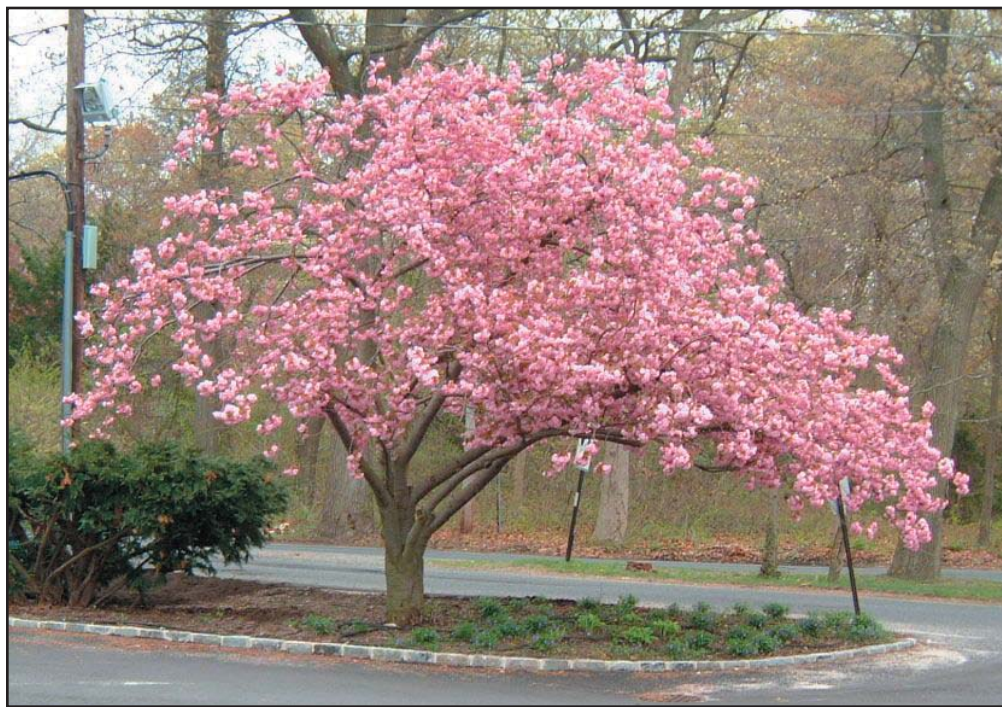
One of Belle Terre's beauties.